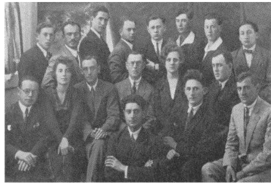
A group of Cześćochowers in the Land of Israel in 1926